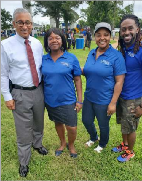
CENTURA COLLEGE STAFF POSE FOR PHOTO WITH CONGRESSMAN BOBBY SCOTT (LEFT).