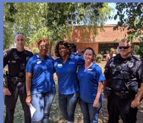
CENTURA COLLEGE CHESAPEAKE HONORS MILITARY AND FIRST RESPONDERS AT HOT DOGS FOR HEROES, A COMMUNITY COOKOUT WITH GAMES AND PRIZES.

Local vendors, such as AT&T, First Command, STOP Inc. and Red Bull were in attendance, sharing resources with staff, students and the community. Raffle prizes included Norfolk Tides tickets and a bluetooth speaker. All recipients of the raffle prizes either served in the military or were military spouses. Centura Chesapeake looks forward to continuing to show appreciation for all the heroes who sacrifice so much for the community and country.