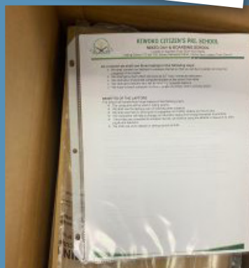
PACKING AND SHIPPING BOXES OF LAPTOPS TO UGANDA

Centura College and Tidewater Tech have teamed up with Aviation Institute of Maintenance (AIM), to donate 60 laptop computers to Kiwoko Citizen's Private School in Uganda and Azalea Gardens Middle School in Norfolk. By working together with the headmaster and principal of the two schools, the colleges have worked to provide hardware, software, and instructional projects that will unite school children around the world in studying cultural research, writing, business technology, and communication.